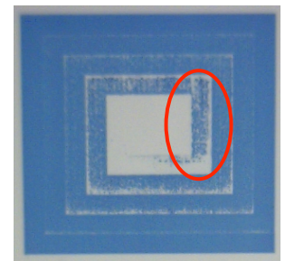
Picture 4: selection of a suitable section for further use in regular print jobs

The following extraction of the respective pattern for the chosen patch must be carried out in pixel based image editing program (such as Adobe Photoshop). Opening a respective mask and then masking off the surrounding areas of the DFTA RWBK 1.0 bitmap file produces the required section to be used in regular jobs. This should be saved under a separate file name and may from then on be introduced as the signal element into all regular jobs to be printed with the combination of printing plate material and processing equipment at hand.