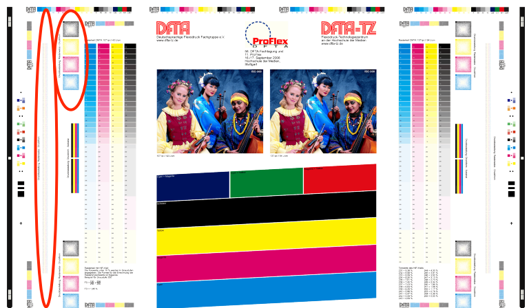
Picture 2: DFTA-TZ test target file including 4 each of the DFTA RWBK elements per colour printer

The DFTA RWBK 1.0 should be positioned into all colour separations at least one time for maximum benefit. In order to do so, the black and white bitmap must be coloured, i.e. the respective colour must be attributed to it virtually in software. It is advisable to position the DFTA RWBK 1.0 once on either side of the web per every colour separation in order to be able to check parallelism between Anilox rollers and printing plates effectively.