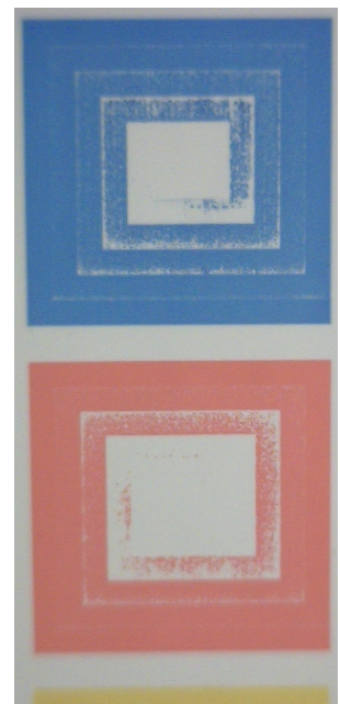
Picture 3: printed results of the DFTA RWBK signal element prior to harmonisation of Anilox-to-Plate impression engagement settings for Cyan and Magenta

Now it is the general amount of overall impression engagement that should be considered over the colour separations. In case they have approximately the same area coverage and kind of design they should require the same amount